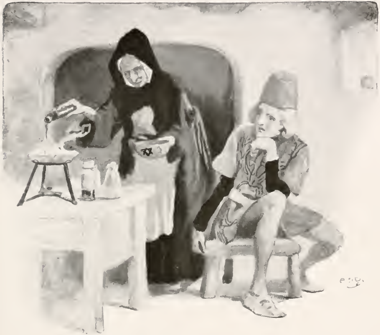
The old woman taught the young Count a good deal that was useful to him. (P. 189.)

In vain the Count pointed out to her that Cuno could not be so easily deprived of his birthright; she wept and scolded until even Stormy Weather, who was generally so stubborn, gave in for the sake of peace, and made a will leaving Schalksberg to Schalk, the younger of the twins, and Hohenzollern to Wolf, the elder, whilst Hirschberg, together with the little town of Balingen, were given to Cuno.